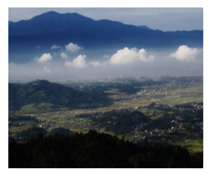
Trekking paths through dark forests take you to many destinations.

Lumo is the Guardian Spirit of the clear spring water. She is the traditional symbol of a clean environment.